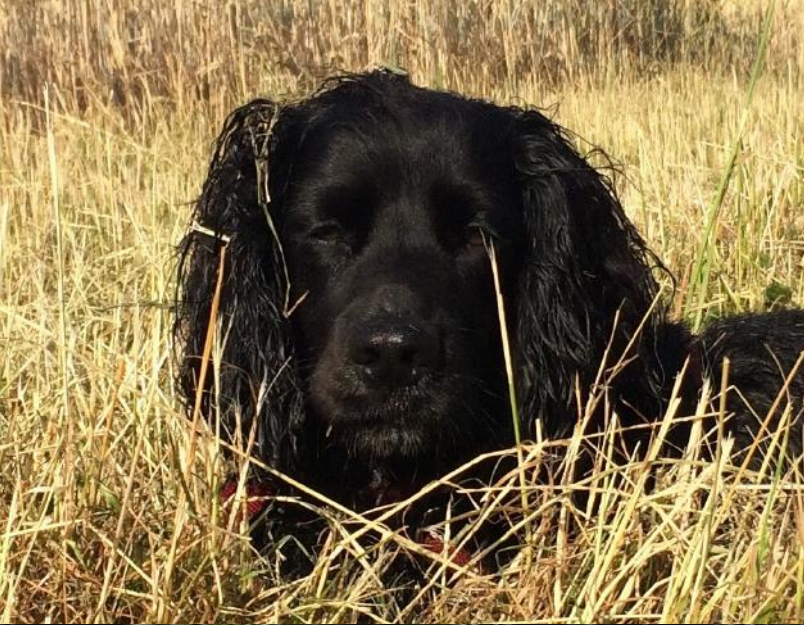
Sid the dog